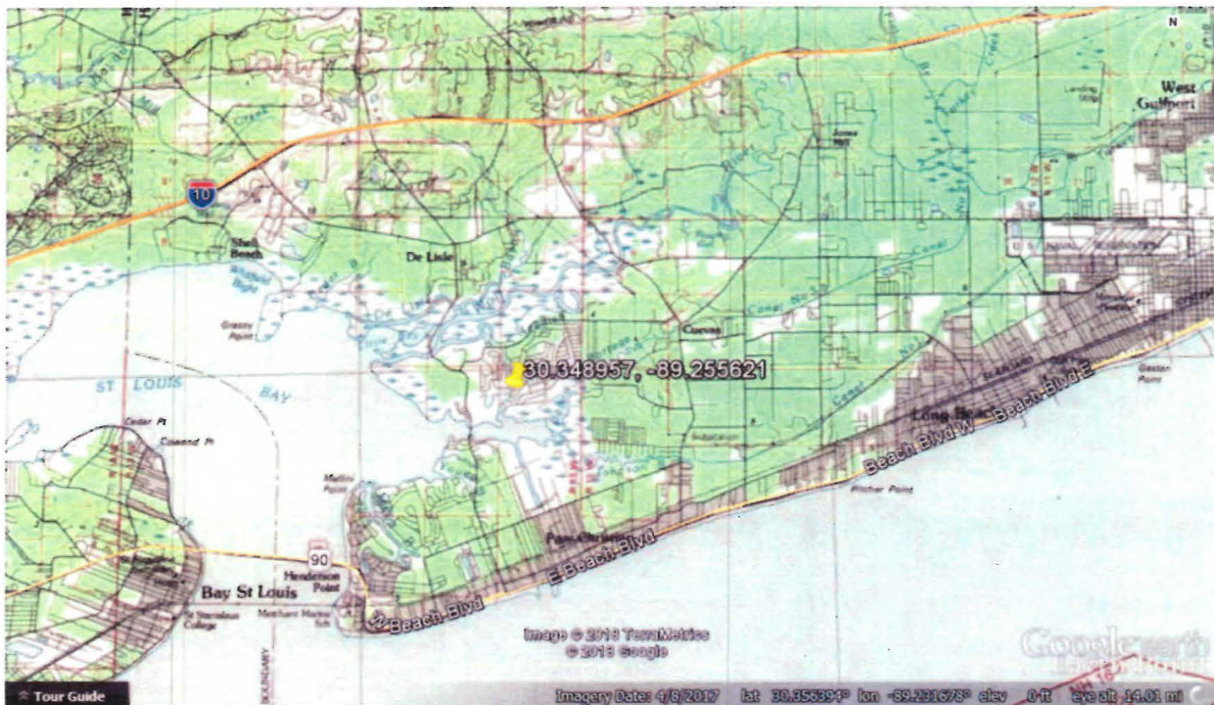
Topo Vicinity Map of proposed rip rap and structures fronting Lots 6 and 7 at end of Spyglass Drive, Pass Christian, Harrison County, Mississippi; File No: SAM-2018-00352-MGS