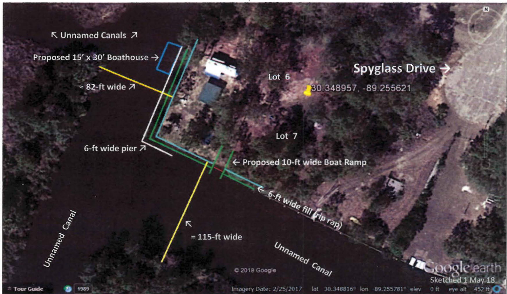
Aerial Site Map of proposed rip rap, boat ramp, wrap-around pier, and boathouse fronting Lots 6 and 7 at end of Spyglass Drive, Discovery Bay Development, Pass Christian, Harrison County, Mississippi; File No: SAM-2018-00352-MGS